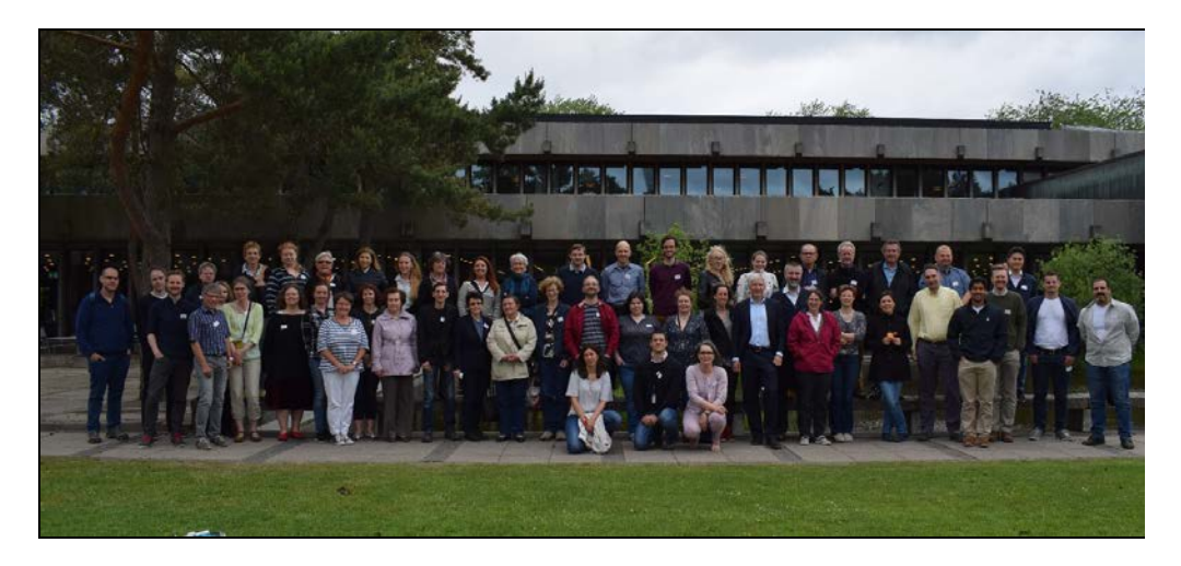
The final report of the 21<sup>st</sup> Annual Workshop is available on the website http://www.eurl-fish.eu/Activities/annual-meetings

The Annual Workshop ended with the traditional fifth session on updates from the EURL. The results of the two proficiency tests sent out in 2016, PT1 and PT2, were presented. The programme and application system for the annual training courses, which will be provided by the EURL in October 2017, was described and participants were given the opportunity to suggest topics for future courses. The planned EURL activities in year 2017 were presented and proposals for the EURL work plan for 2018-2020 were discussed.