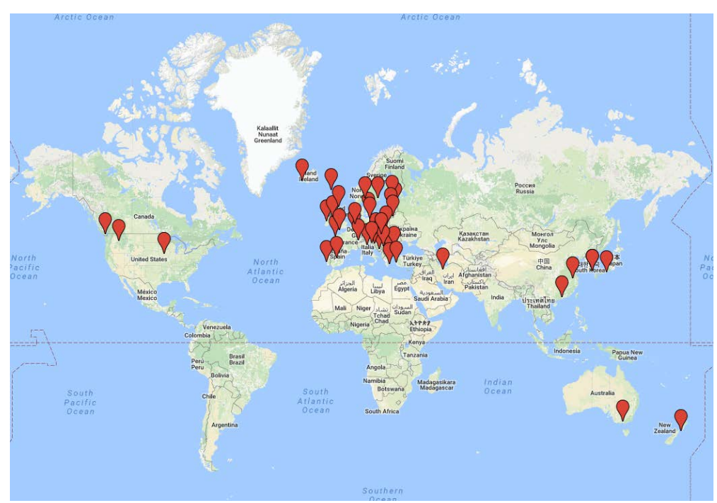
Participating laboratories in PT1 and PT2 in 2017