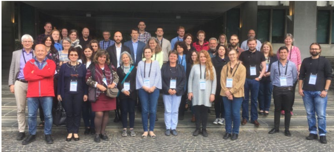
10 th Annual Workshop, 2019, first in DK