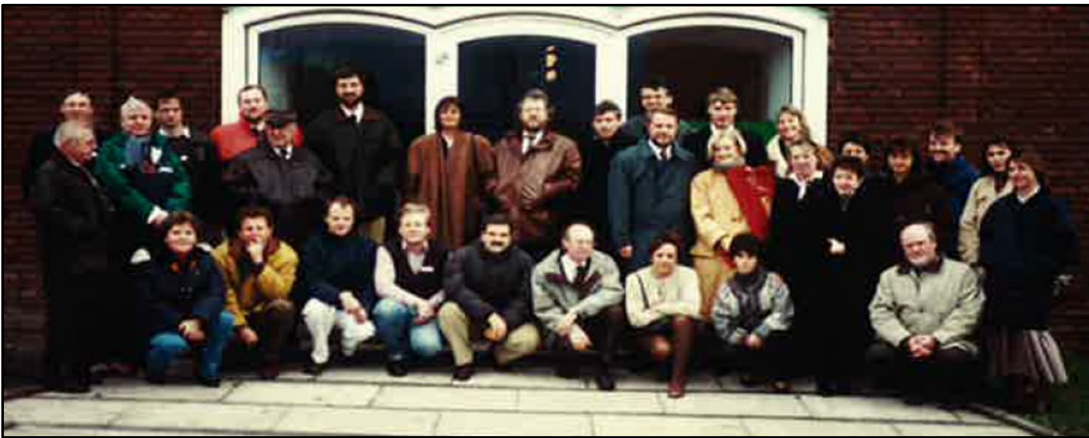
1 st Annual Meeting Aarhus 1996