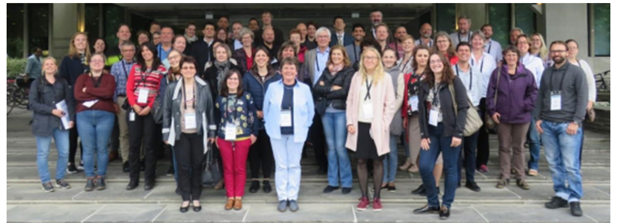
23rd Annual Workshop, 2019